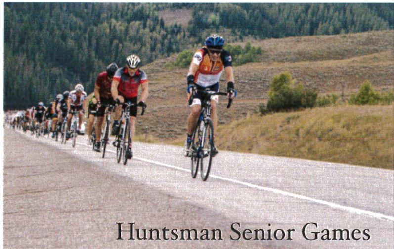
Huntsman Senior Games