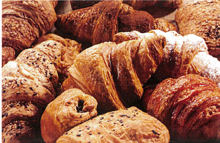
Farmstead Manufacturing / Bakery expands operations in Leeds, Utah

The estimated completion date for the expansion is set for spring of 2024. The business intends to employ between 25 to 30 personnel.